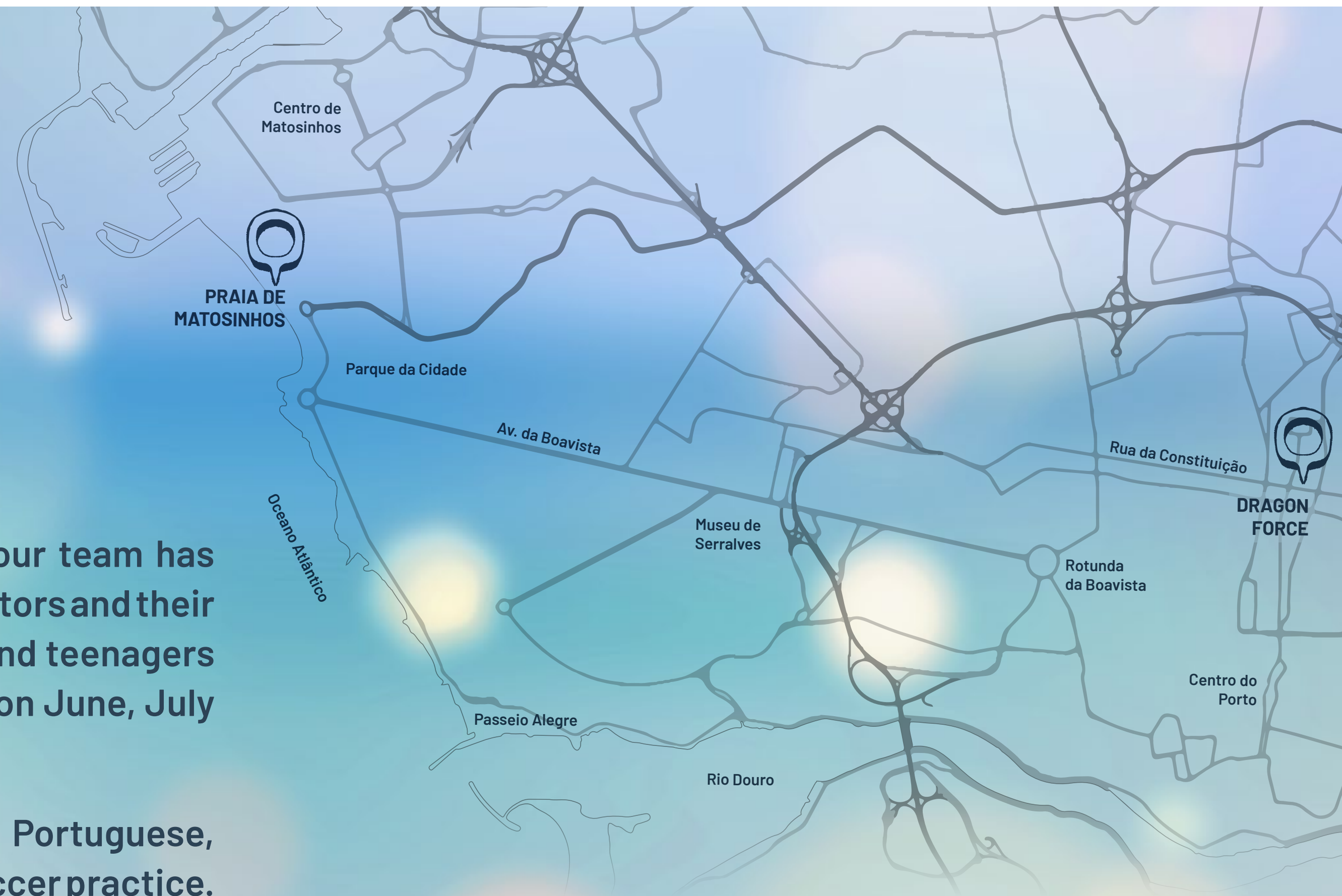
Porto Area City Map

Book your Summer Camp in Porto one month in advance to secure your place! Please send e-mail to learningportuguese@iaservices.pt